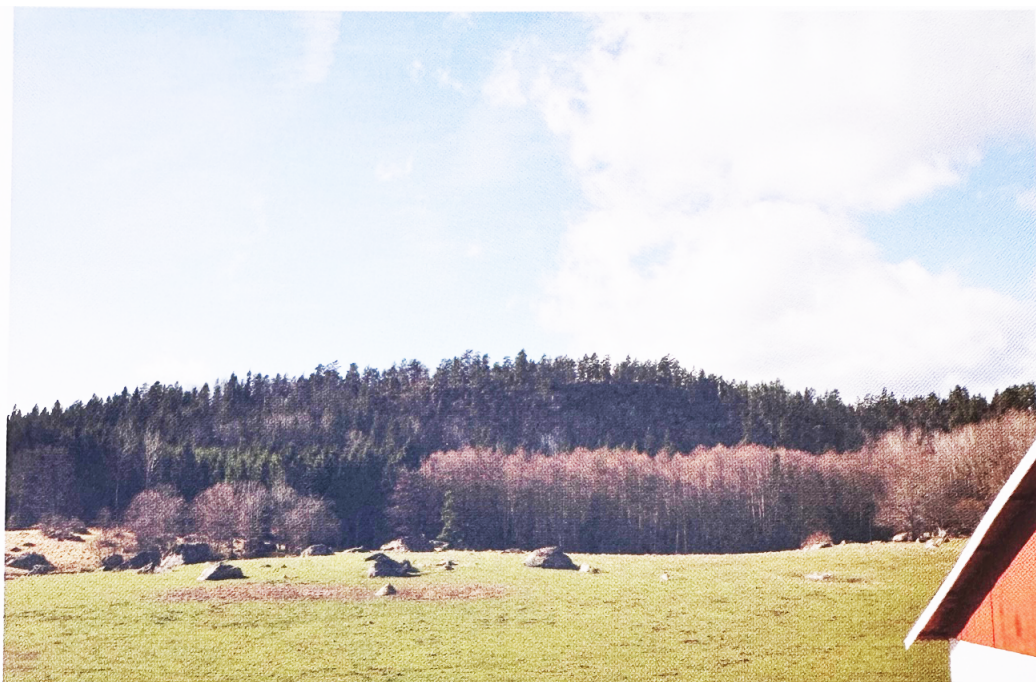
KORPBERGET TYNN