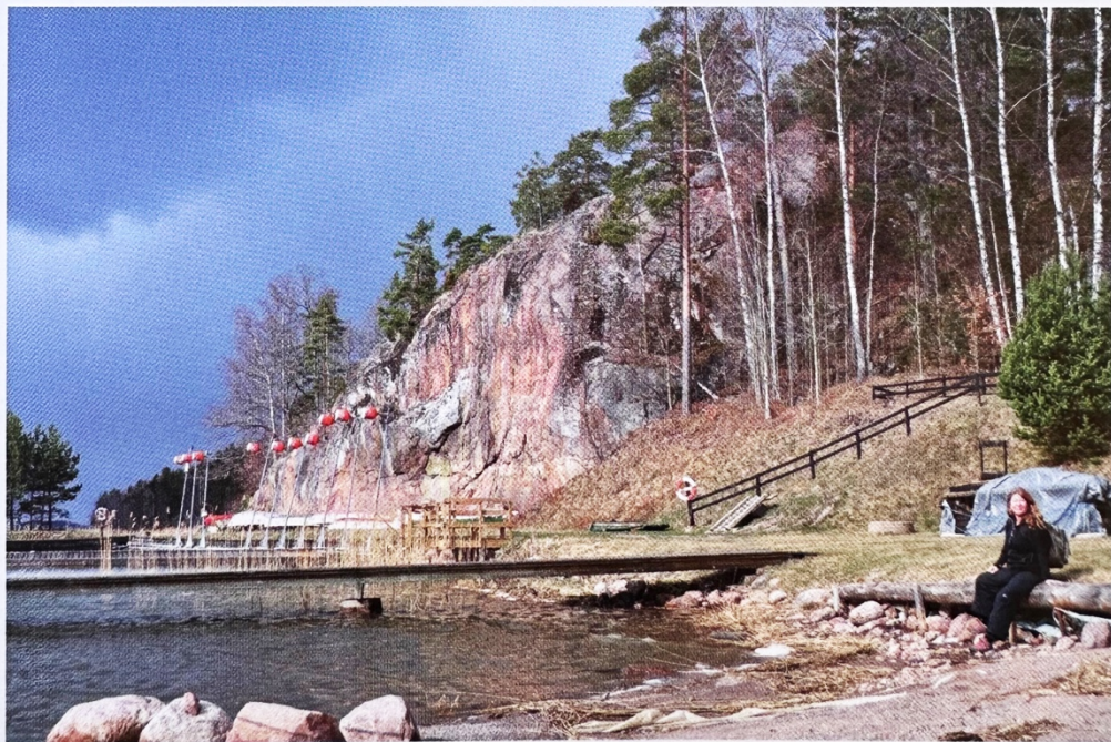
ANNA WASMUTH