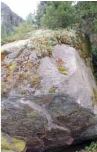
Off Wolf and Man