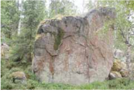
In a Face